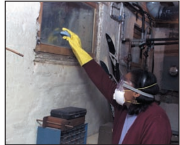
Cleaning while wearing N-95 respirator, gloves, and goggles.

■ Wear goggles. Goggles that do not have ventilation holes are recommended. Avoid getting mold or mold spores in your eyes.